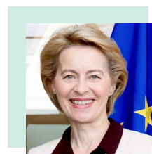
Ursula von der Leyen, President of the European Commission