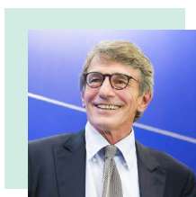
David Sassoli, President of the European Parliament

The Conference is placed under the authority of the three institutions, represented by