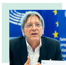
Mr Guy Verhofstadt, Member of the European Parliament

The Joint Presidency is supported by an Executive Board , which is co-chaired by the three institutions.